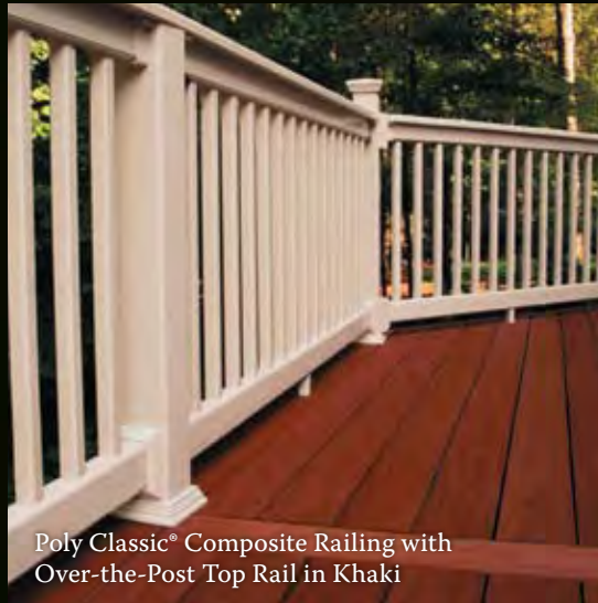
Poly Classic® Composite Railing with Over-the-Post Top Rail in Khaki