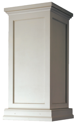
Prairie Pedestal Recessed Panel