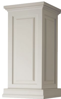
Prairie Pedestal Raised Panel