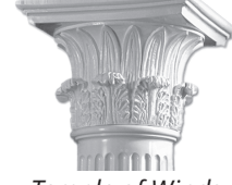
Temple of Winds