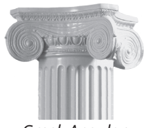
Greek Angular Ionic