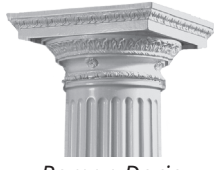
Roman Doric Ornamental