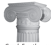
Greek Erectheum with Neckring