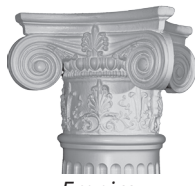
Empire with Neckring